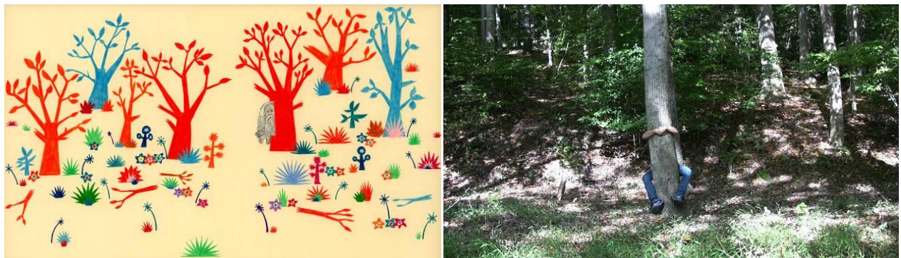
Images: Michael Krueger's "Hermit's Delight," Cari Freno's "Tree Jump" (video still).

Works included span photography, sculpture, painting, drawing, printmaking, quilting, collage, audio, video, performance, installation, cooking, and urban design. The exhibition approaches the tree theme as