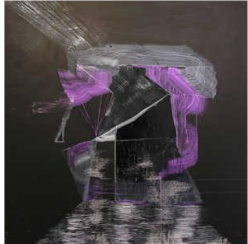
"Violet Paper Shredder" (2008), by 2009 award winner Andrzej Zielinski, is currently on view in Zielinski's one-person show at Dolphin gallery.

Warren recently presented an installment of Whoop Dee Doo, her series of community variety show productions of wildly diverse acts, at Deitch Projects in