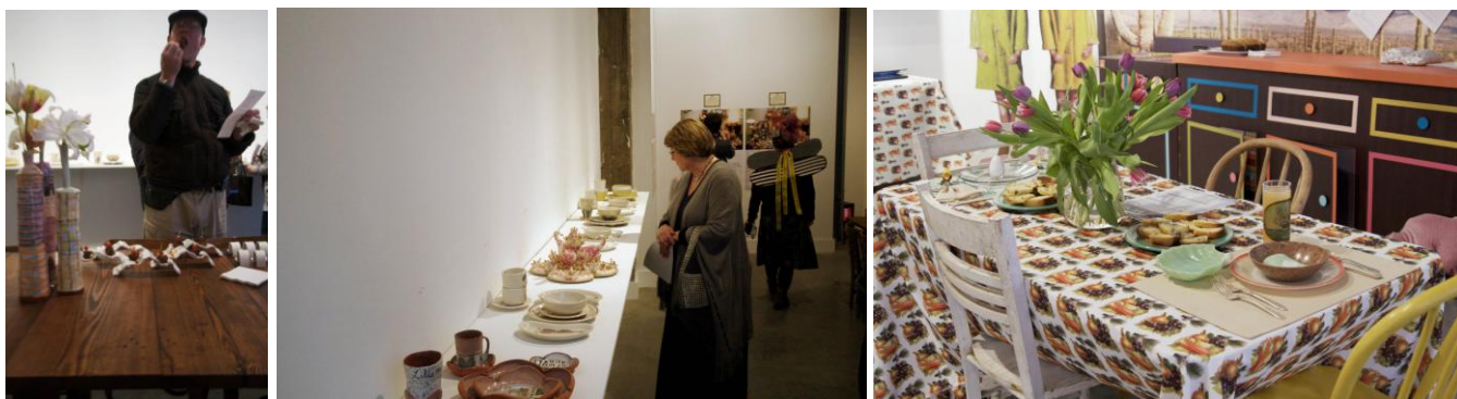
Views of The Dining Room Project at Paragraph.