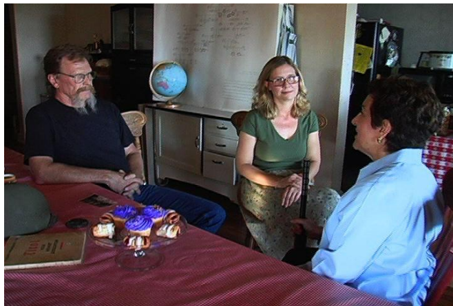
The Last Descendants: Hansel and Gretel (video still), 2011, 6:45 min. video. Click here to view video clip.