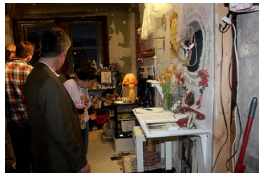
Studios at Town Pavilion & pARTnership Place

For more about Charlotte Street Foundation's Studio Residency Program and the 2013-14 Studio Residents, visit http://charlottestreetstudios.wordpress.com .